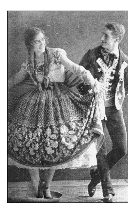
Figure 1. Charro and china poblana stereotypes performing the famous jarabe tapatio .

Tehuana and china poblana outfits were culturally and politically safe and racially neutral. They provided a nonthreatening way of celebrating Mexican popular culture, aided by their similarity to European peasant outfits. (It was also common to modify the costumes to exaggerate their resemblance to French, Spanish, Portuguese or Dutch peasant vestures.)<sup>29</sup> They promoted Mexican culture while inviting comparisons to European folk traditions, and they celebrated regional traditions while deflecting attention from the country's cultural fragmentation, rural exploitation, and the gulf that separated existing aesthetic canons from the reality of Mexico.