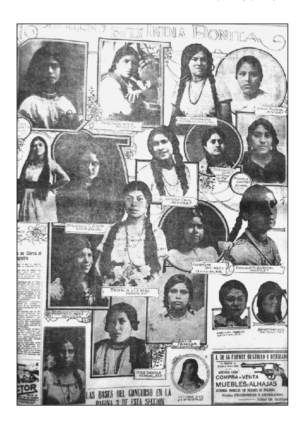
Figure 2. Some India Bonita contestants.

The peculiar way the India Bonita Contest was promoted becomes clearer when we compare it to the Concurso Universal de Belleza. Both contests objectified women and feminine beauty, yet we find important differences between the two events. Parisian planners of the French-based Concurso Universal de Belleza invited different countries of the world to send national representatives, and El Universal took charge of organizing the search for Miss Mexico.<sup>34</sup> Since it was based upon a relatively agreed-upon canon of beauty, the organizers of the Mexican branch of the competition (some of whom were also involved in the India Bonita Contest) issued a simple call for photos of