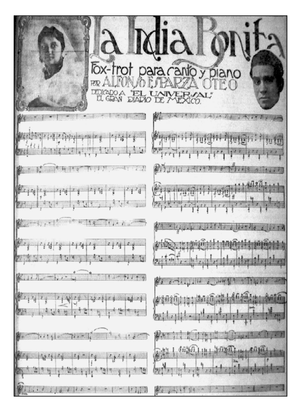
Figure 7. A foxtrot dedicated to the India Bonita.

stereotypes (chinas poblanas, tehuanas, and charros) that had long enjoyed widespread recognition, and which were easily consumed due to their lack of reference to race or class, and thanks to their similarity to European folk types. The repertoire remained limited and nonthreatening—even the few portrayals of indígenas generally avoided any allusion to political marginalization or class oppression. But those few that included portrayals of Indians did succeed in drawing attention to Mexico's indigenous population, to Mexican diversity, and to other issues that fed into more progressive politicking.