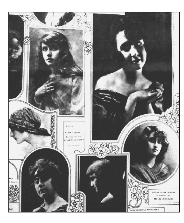
Figure 3. Some Miss Mexico finalists.

Mexican beauties. No training of the audience was necessary, nor did the newspaper publish any photos until after the finalists were selected (see figure 3; compare with figures 2 and 4.) Organizers and participants relied on a shared knowledge about what constituted "universal beauty," and no one found it necessary to explain why only white women were included among the finalists.<sup>35</sup>