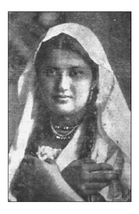
Figure 5. Maria Bibiana Uribe.

her language ("Mexicano" [Náhuatl]), and the specifics of her racial lineage ("Aztec"). ^{48}\,